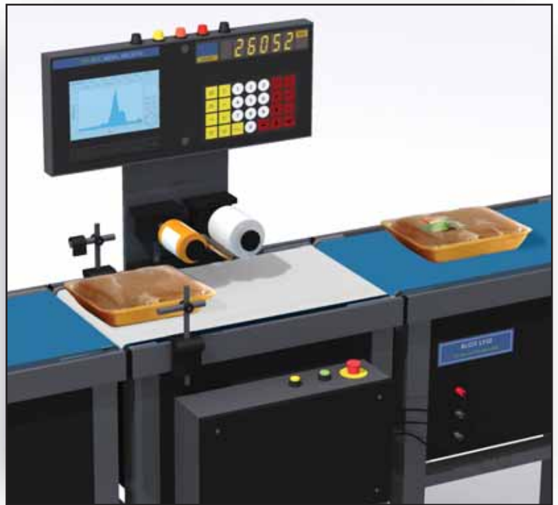
GMT3 belt is ideal for synchronous conveying applications involving small diameter transfers such as those found in check weighing.