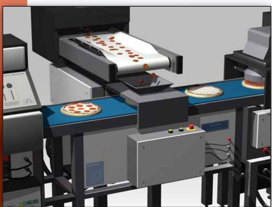
CenterClean belts are constructed with flexible urethane and sealed Kevlar® tension members. This construction allows CenterClean belts to be troughed and run on small diameter pulleys with minimal belt stretch.