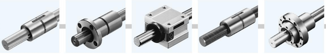
BALL SPLINE ROTARY BALL SPLINE