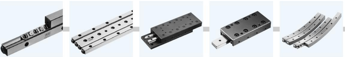
SLIDE WAY SLIDE TABLE GONIO WAY