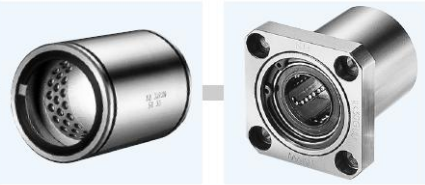
STROKE BUSH SLIDE ROTARY BUSH